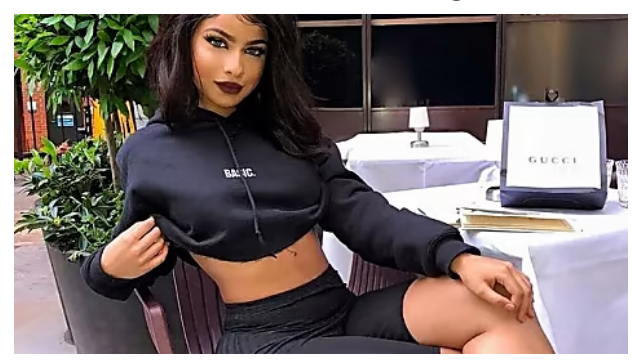
Millionaire Mom Exposes ¢156,679 Work From Home Secret